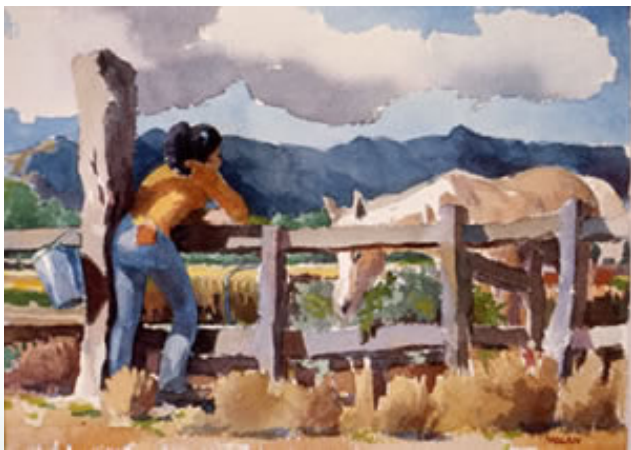
Girl and Horse Watercolor, Joe Tibbets