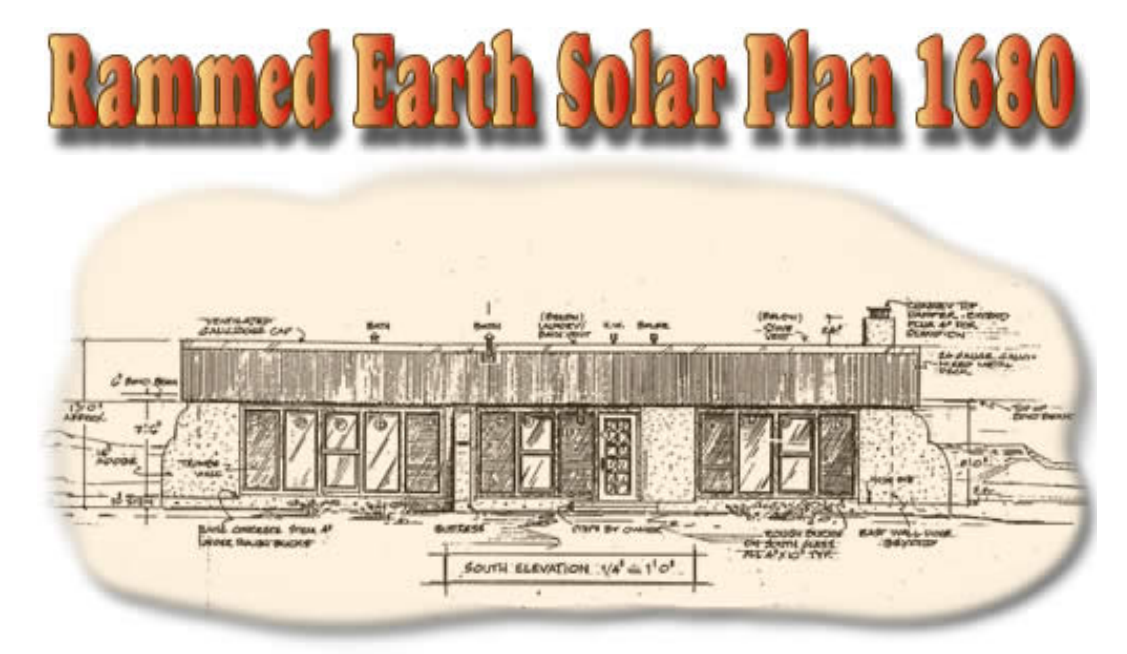
Rammed Earth Solar House Plan 1680

Adobe Builder brings you home to - rammed earth solar house plans. Low cost and affordable simple passive solar designs online.