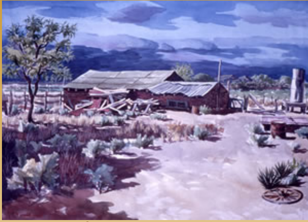
The Forgotten Farm Las Cruces, New Mexico Watercolor - Joe Tibbets